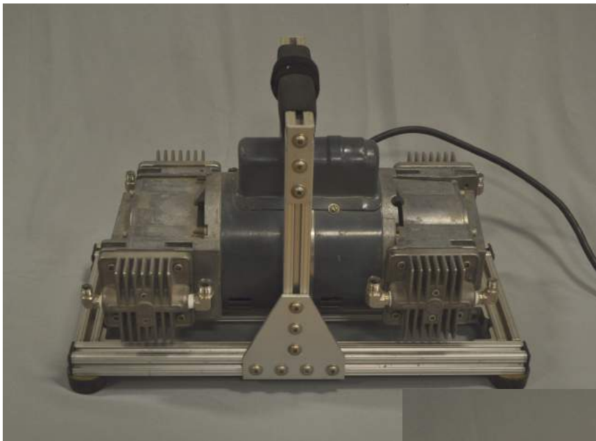
4-head gas sampling pump (left) and with gas conditioners (below)