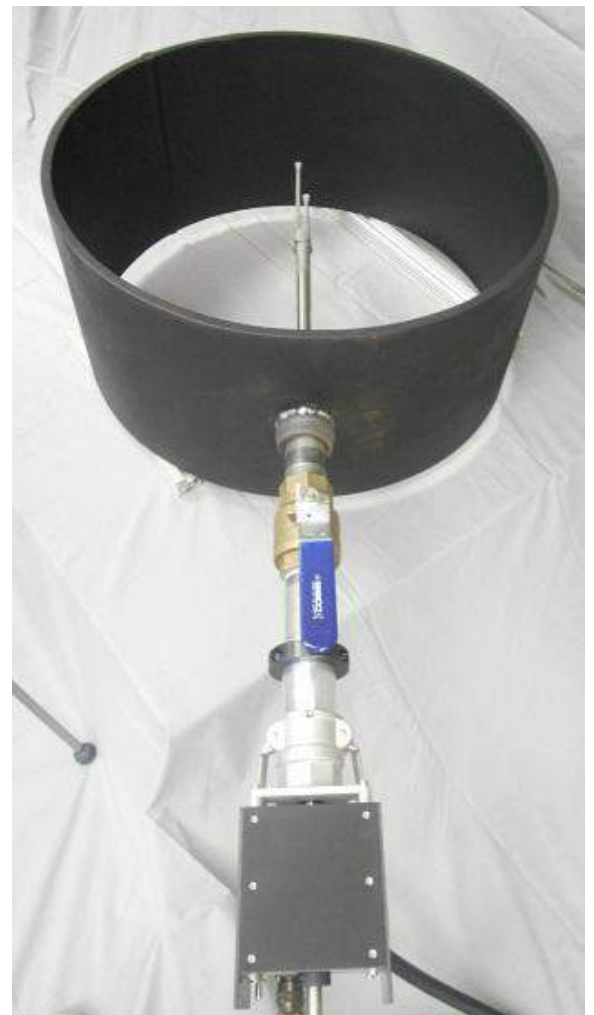
Motorized SwivelSampler mounted on demonstration coal pipe