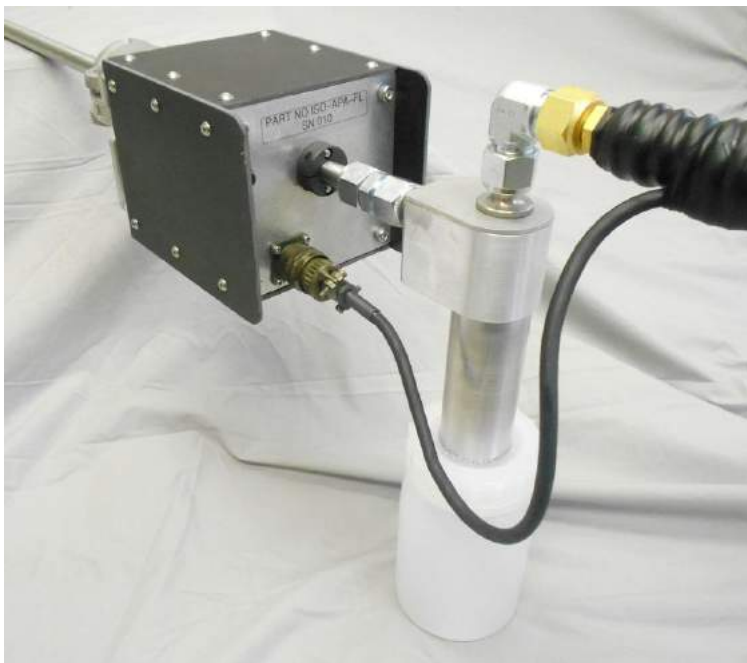
Motorized SwivelSampler, cyclone separator, sample jar, and umbilical