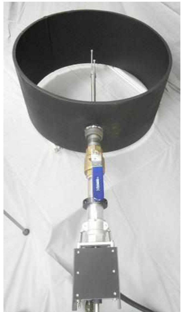
Motorized SwivelSampler mounted on demonstration coal pipe