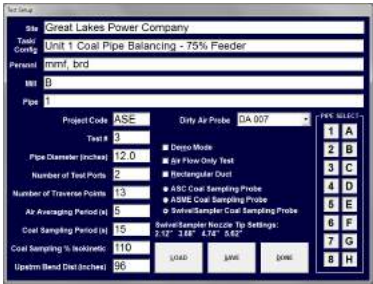
Test Setup Screen