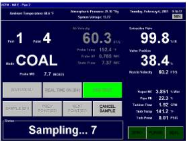
Run Test Screen