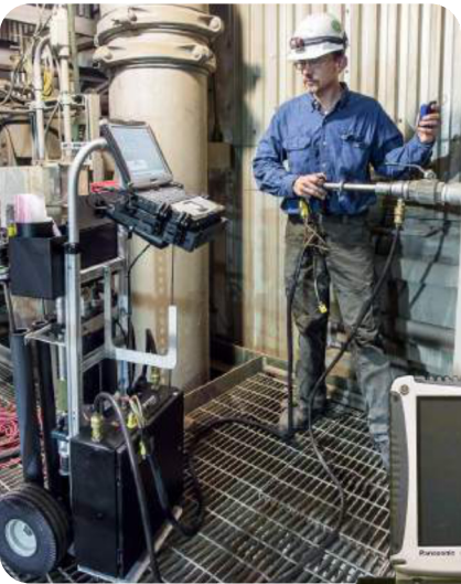
Touch screen and remote allows single operator to perform test