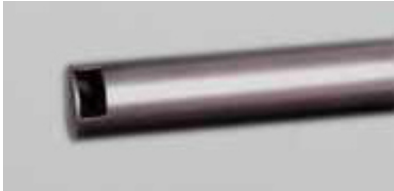
ASME PTC 4.2 sample nozzle