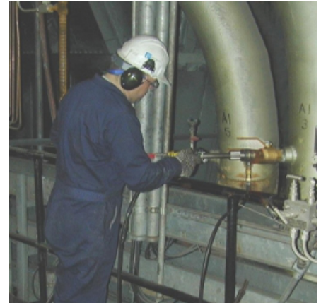
ASME PTC 4.2 sampling in a coal pipe

The standard system (ASE part no. ASME-SYSTEM-V2) is shown in the photograph below.