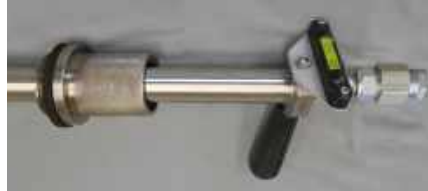
ASME probe end with bubble level and handle