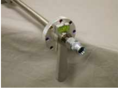
Alignment level, rotation indicator, and handle