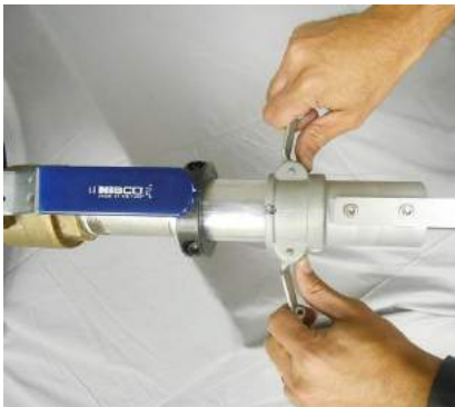
Fast-Lock Seal Air Fitting (mounts on each pipe, sold separately) is a snap to close