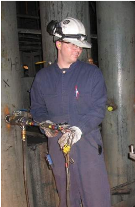
Velocity testing in a coal piping system

The Dirty Air Pitot (DAP) probe is utilized to measure air velocity, pressure, and temperature within a flow stream that is heavily laden with particulate.