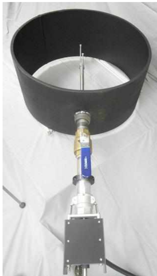
Motorized SwivelSampler mounted on demonstration coal pipe