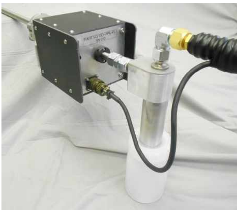
Motorized SwivelSampler, cyclone separator, sample jar, and umbilical