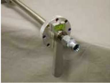
Alignment level, rotation indicator, and handle