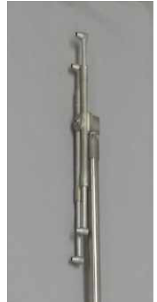
SwivelSampler™ probe head