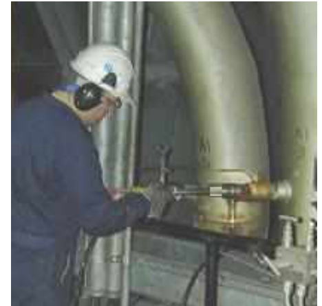
ISO 9931 sampling in a coal piping system

The standard system (ASE part no. ISO-SYSTEM-V2) is shown in the photograph.