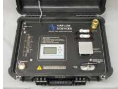
Control panel with PLC controller